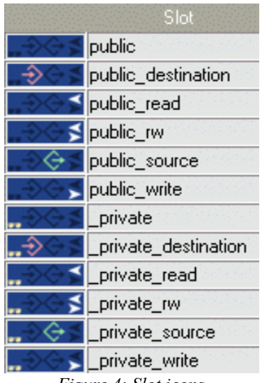
Figure 4: Slot icons

The next page of the notebook lists all of the slots available on the object, including those whose values are inherited. Inherited slots are highlighted in yellow, and clicking on an inherited value in an attempt to change it pops up a dialog for the user to confirm (or cancel) setting a new, local value for the slot.